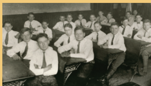
Grade 7 boys class from the original school.