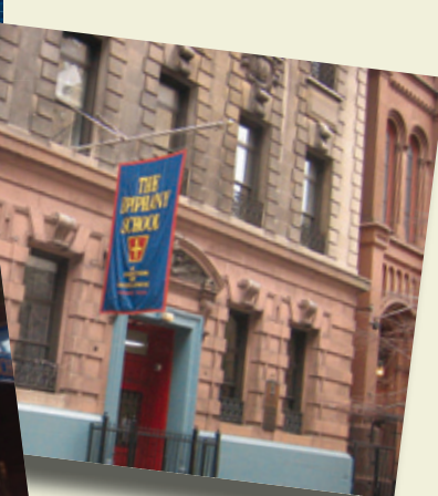
Top left: Lower Campus at 234 East 22nd Street