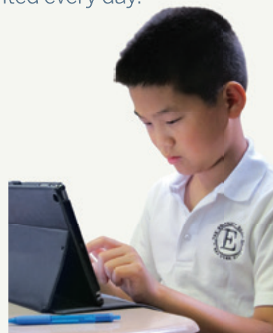
New adaptive/interactive software provides practice for students' individual needs.

Each student is able to work at his or her pace on the iPad. Teachers are able to assign work to each student based on the students' needs through programs like Reading A-Z and IXL Math.