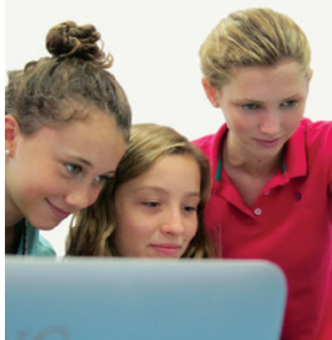
Through Google Classroom, documents can be shared between students and teachers.

Students work on projects together for their classes. Each student has a Google account that allows for instant collaboration. The project can then easily be shared with the class. Our students are learning to work as a part of a team.