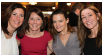
The Spring Auction was the largest fundraiser ever held by The Foundation. The Special Appeal funded RealTouch Displays throughout The School.