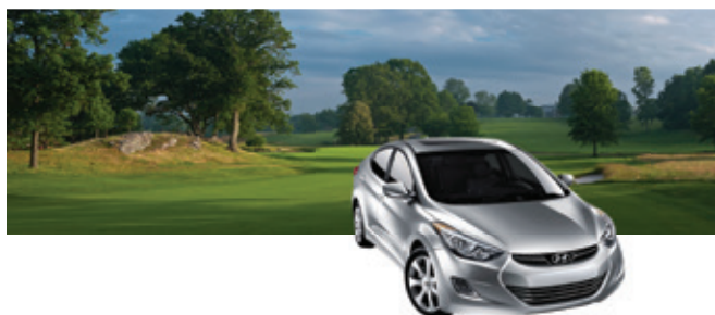
The Golf Outing at beautiful Wykagyl Country Club featured prizes by Hyundai, who helped sponsor the event.