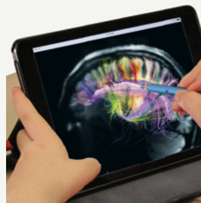
There is a multitude of applications for creating presentations, which can ultimately be viewed on large format screens.

Students are learning many different platforms for presentation and publication. The variety is teaching them to choose the best platform for the information they want to share. "Should my presentation be a traditional paper, a Prezi, an iBook or an iMovie?" Our students are learning to think about their choice of format and the impact it has on the sharing of information.