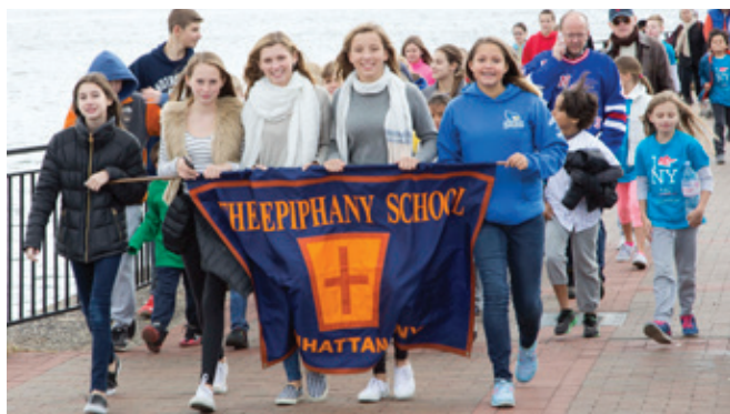
The Annual Charity Walk strolled along the East River and ended at 22nd Street where the Fall Festival was held. This year, over 5,500 meals were collected.